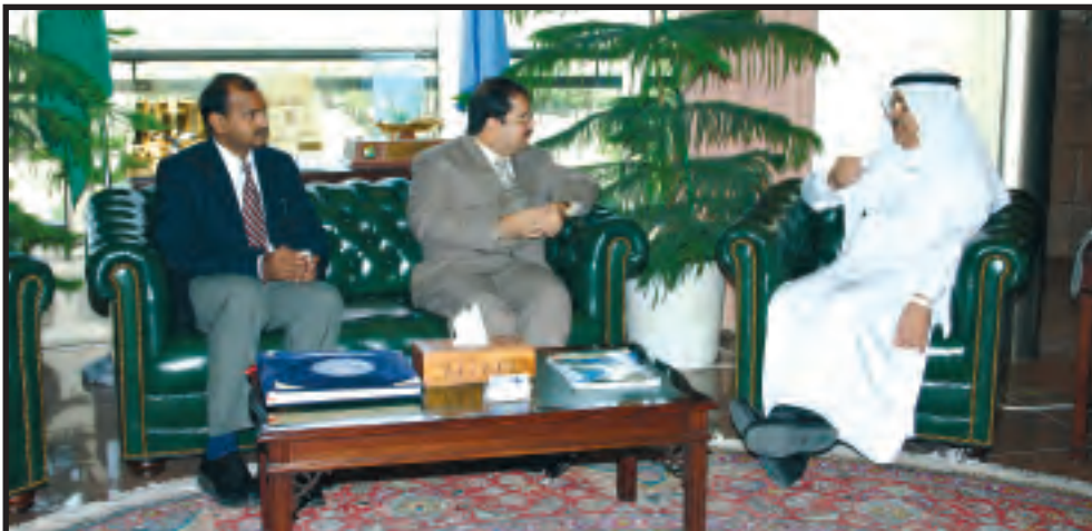
Consul General & Consul (P&I) with the President of KAAU