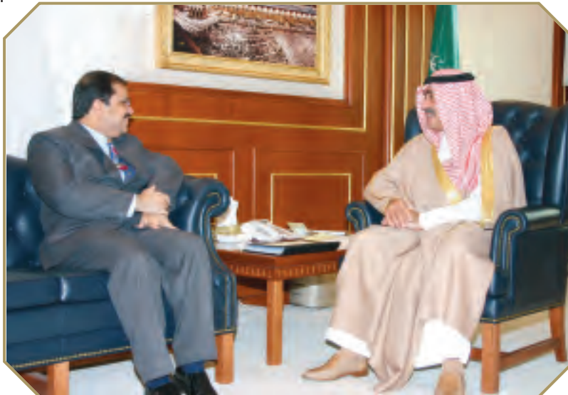
[Consul General with Governor of Madinah]

Education. He further briefed the Consul General of his future plans to transform the Madinah region into an international hub for commerce, education, hospitality and transportation, which could serve as a historic development model for the Islamic World for the next 20 years. HRH Prince Muqrin also expressed his desire to be benefited from India's expertise in his envisioned future plan.